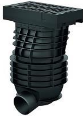
Fig. 3. Cast iron street drain