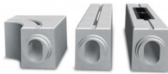
Fig. 8. Gutters using M profile

Slit gutters are indispensable for the construction of public roads (Fig. 8). The slot system is a progressive method of draining water on large paved / asphalted surfaces, such as public roads, highways, airports, ensuring the rapid and efficient drainage of rainwater from areas where the classic drainage it is not enough. The demand for this product is constantly growing due to the development of large logistics centers, where they are used to drain water from large asphalt / concrete / paved surfaces, etc.