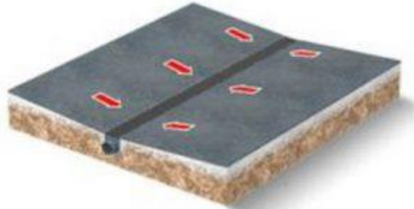
Fig. 2. Linear drainage of rainwater using gutters

In the case of linear drainage (Fig. 2), the water is taken and directed through a gutter.