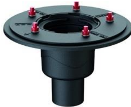
Fig. 7. Drain system with dimensioning elements.