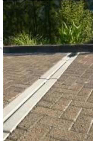
Fig. 9. Implementation of gutters with M profile