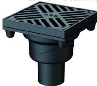
Fig. 6. Cast iron drains for installation in multi-storey car parks