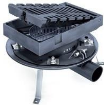
Fig. 5. Special drains for bridges