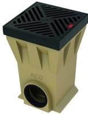
Fig. 4. Drain with concrete body