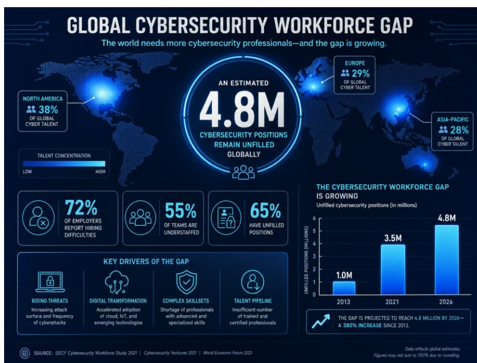
Figure 4: The Global Cybersecurity Workforce Gap and its impact on organizations.