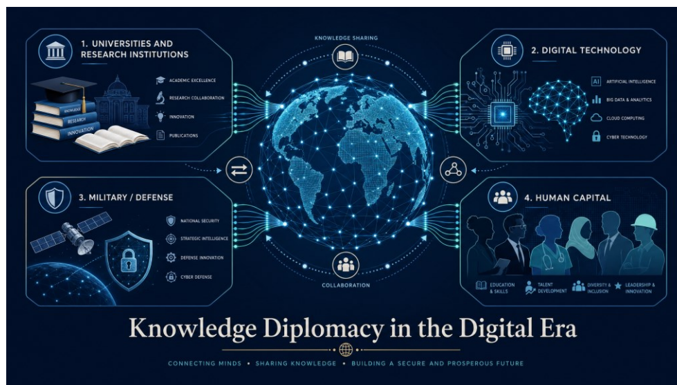
Figure 1: The Intersection of Knowledge Diplomacy, Digital Technology, the Military Sector and Human Capital

The digital revolution has generated an unprecedented transformation in how knowledge is produced, disseminated and utilized in international relations. Digital platforms, artificial intelligence and big data have created new opportunities for cross-border scientific cooperation, but have also generated new vulnerabilities and power asymmetries. In this context, knowledge diplomacy can no longer be separated from the technological and, implicitly, the military dimensions of international relations.