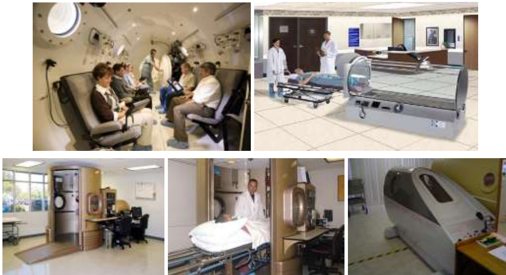
Figure 2. Various versions of mono and multi-lock chambers for oxygen therapy.