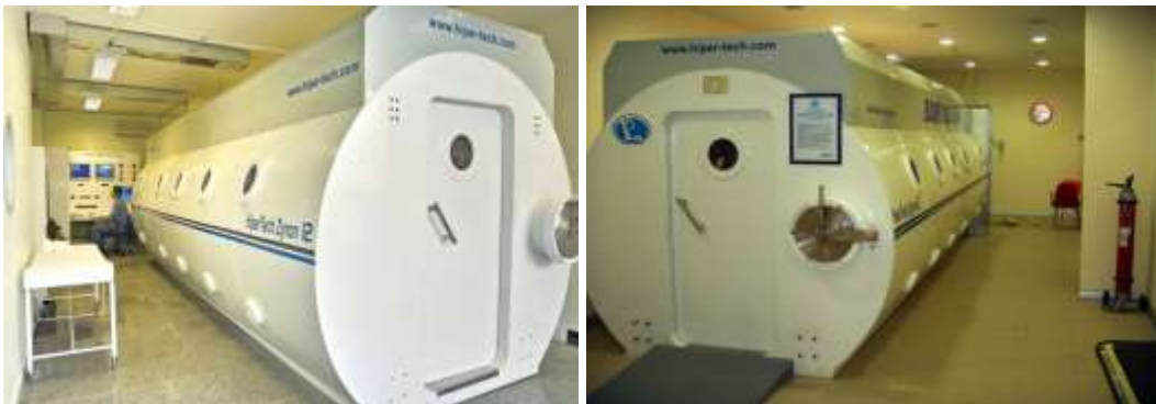
Fig. 3. Types of Hyper-tech multi-lock chambers.

Thus, in order to consolidate the old performances and in addition to align them with the current requirements and technologies of hyperbaric oxygen therapy, the idea of modernization revolves around "common sense" interventions.