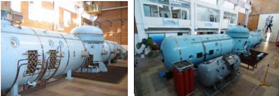
Fig. 1. The Diving Centre Hyperbaric Laboratory.

The present configuration of the Diving Centre's ASS 500 Hyperbaric Complex, which covers the range of missions listed in another chapter, namely treatment of those involved in diving accidents, carrying out oxygen and narcosis tests, training the divers in a dry and wet environment, previously regarding unitary and saturation diving activities, comprises: a central hall, a compressor compartment, regeneration assembly and gas storage, a compartment for various groups of power and water supply.