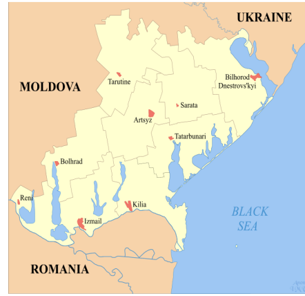
Map II. Budjak's Borders