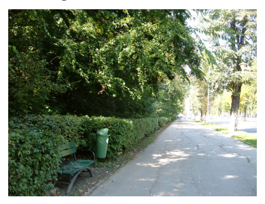
Fig. 4. Niche with a bank, on the Boulevard Pavel Kiseleff, in the year 2006 (photo original)

In fig. 4, It is to be noted that hedge hornbeam (Carpinus betulus L) ., had some niches, in which they were located banks. The hornbeam can help to ensure the height required to that slots to provide isolation from the rest of the space.