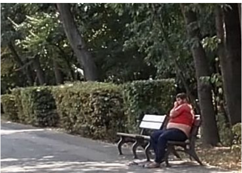
Fig. 7. Prospective "tired walkers" which sleep or are resting on the benches, are exposed to all vision along the road