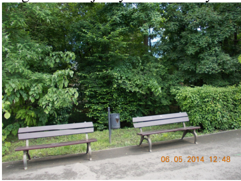
Fig. 5. Niches in which they were located banks can barely be identify

The hedge become an old one, that in many places can barely recognized its existence, and niches are gone in majority or can barely been identify (fig. 5).