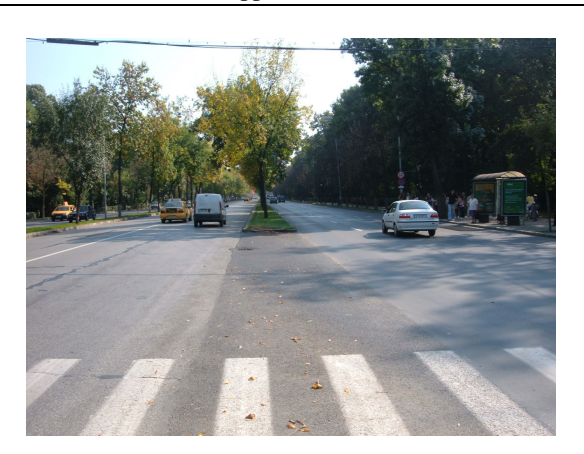
Fig. 3. Boulevard Pavel Kiseleff from "Piata presei" up to the Arch of Triumph, has three races separated through spaces planted with a row of trees, (photo original)

From the Square of th Arch of Triumph, remain only four lanes, up from the Street Architect Ion Mincu. This portion has buildings surrounded by wide-open spaces, with rich vegetation- trees and bushes, which facilitates atmospheric currents. From the Street Architect Ion Mincu it links with Kiseleff Park, which it crosses up to the Museum of Geology – to Victoria Square. (Fig.2). Then, from Victoria Square up in the Romana Square, by the Avenue Lascar Catargiu, ensures good ventilation of the city, while maintaining a microclimate very comfortable and hygienic.