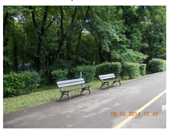
Fig. 6. Banks have been placed on the sidewalk outside former niches.

In addition, these banks can be seen along its entire length road, and casual "tired people", which slept on them, are exposed to sight and we don't think that their image makes a good impression for visitors - foreign and Romanian ones - in the buses which called "Bucharest City Tour".