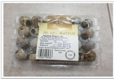
Fig. 2. Eggs from quail fed forage improved with camelina meal