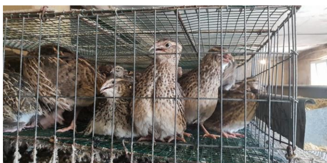
Fig. 1. Quails

We chose for experiments, a quail farm in Ilfov county with a capacity of over 3,000 quails from the town of Cornetu, which has all the related certifications and documents, where we did research on feed, feed improved with camelina meal, improved feed with probiotic-enhanced camelina meal and the effect on quail egg (Figure 1).