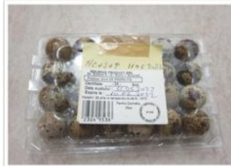
Fig. 3. Eggs from quail fed feed improved with camelina meal and probiotic

Quail egg evolution is essential to observe the nutrient intake of camelina meal and probiotic-enhanced camelina meal in terms of monounsaturated and polyunsaturated fatty acids.