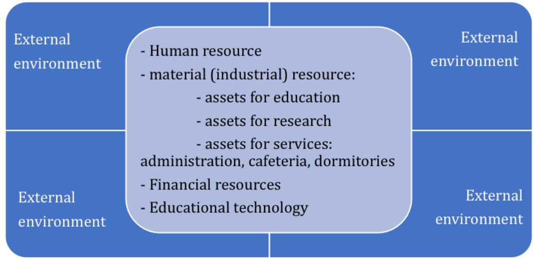
Fig. 2. The institution of education.

A relevant representation of education is given in Figure 2.