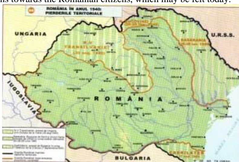
Figure 4. Loss of Romanian territories after the Vienna Award. 36

army was against them, just as the vast majority of the civilian population. This attitude was also due to deep anti-German resentment caused by loss of the Romanian territories (Figure 4) to German allies (USSR, Hungary and Bulgaria), in the Vienna Award , 35 as well as the despising attitude of the Germans towards the Romanian citizens, which may be felt today.