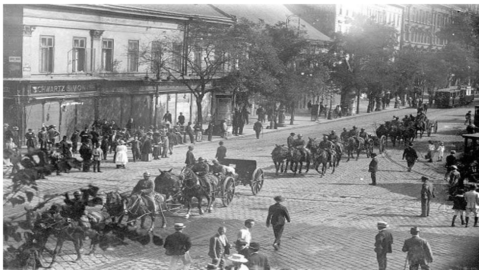
Figure 2. Romanian cavalry division enters Budapest 27

Tisza 25 to attack Budapest and defeat the Bolshevik revolution. The cavalry division was the first that entered Budapest 26 (Figure 2) and realized that the revolution had just been crushed by the population, but the new government still wanted the annexation of Transylvania. A large part of Hungary, including Budapest, was temporarily occupied by the Romanian Army in order to avoid the annexation of Romanian territories (Figure 3).