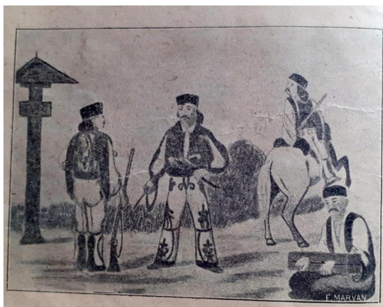
Photo 4: The pandurs restrained a thief into a pillory (Apostol D. Culea, Album Istoric. Istoria Românilor în Ilustrații , Editura Institutului de Arte Grafice Ramuri, Craiova, 1926, p. 82).