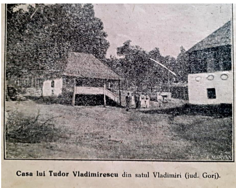
Casa lui Tudor Vladimirescu din satul Vladimiri (jud. Gorj).