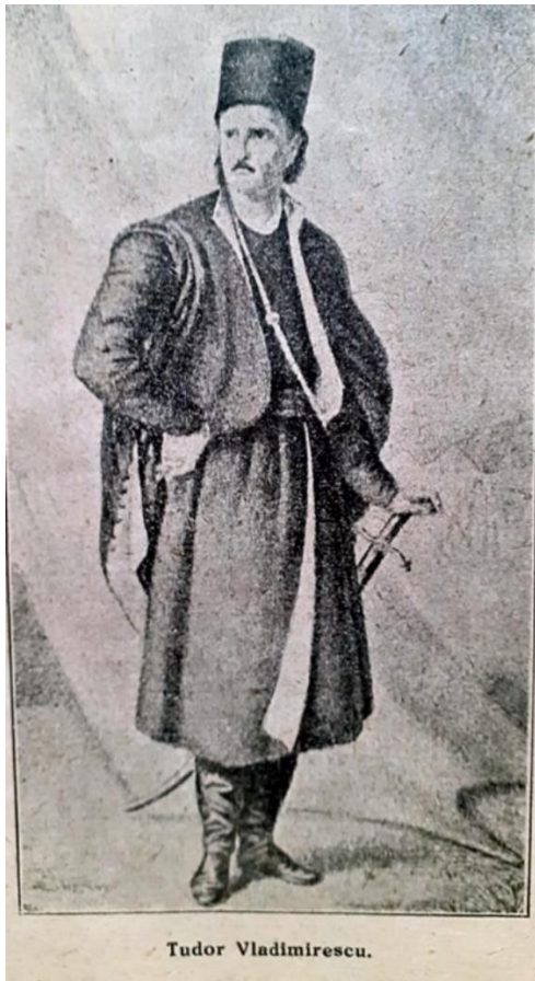
Photo 2: Tudor Vladimirescu.