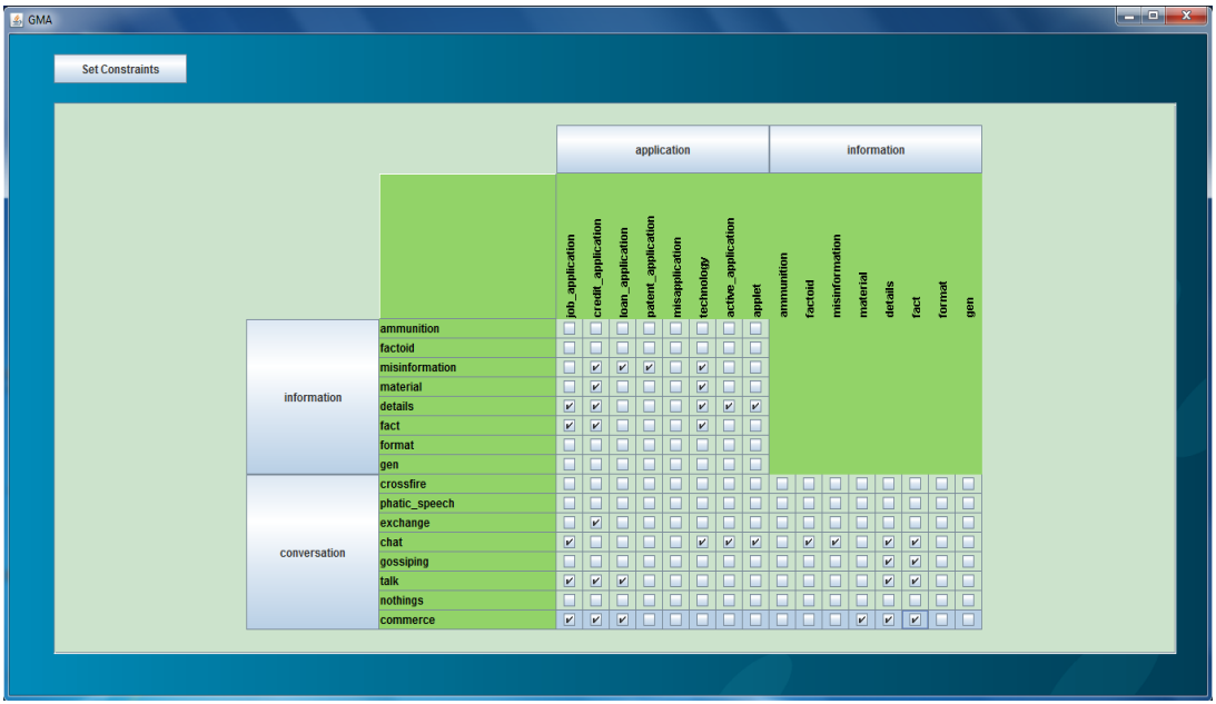
Fig. 7. Constraints Window.

Aside from using this program by a single user, a good idea would be to compare the results with different users, for the same selected topics.