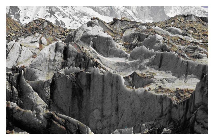
Fig. 6. The Gangotri glaciers (Himalaya Uttaranchal, India) (Web 4).

The melting of the polar ice caps, associated with the decrease, even the wear out of the ground water, with decreasing flow of surface waters, represent a big threat to humanity now. One example is in India, the great Gangroti glacier is retreating today (Fig. 6). It is the source of the water for the Bhagirarth River, the main affluent of Gange River, the main source of surface water for irrigation and drinking water for 400 million people from this river basin area (Brown, 2011). The examples may continue.