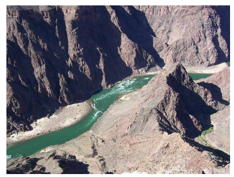
Fig. 2. The Colorado River (South-East of US) (Web 1)

Today there are many rivers that no longer reach the outfall and the best examples is the Colorado River in the southwestern of United States (Fig. 2) and the Yellow River, the largest river in northern China (Fig. 3), which during the hot and dry seasons, or dries up or turns into a brooklet, which seeps into the sea. Similar problems have the Ganges River in India and some rivers in Iran, Iraq and Pakistan. But there are rivers that have gone missing, remaining only on the geographic maps.