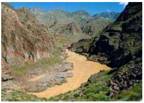
Fig. 3. The Yellow River (The North of China)(Web 2)

The substantially increasing and uninterrupted water consumption is a natural consequence of the permanent water requirements, which not always can be satisfied by the natural water sources. For this reason it has imposed the realization of many dams, deflection of reservoirs, thoroughfare canals, derivatives, etc. (Rojanschi & Bran, 2002).