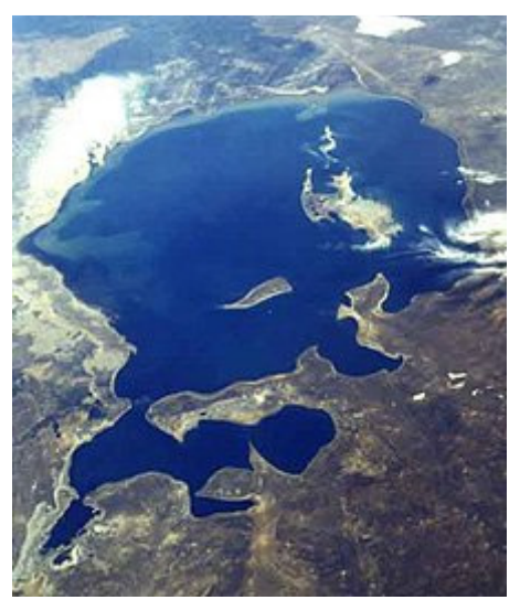
Fig. 4. The Aral Sea (The Russian Federation) (Web 3).

You can't give a precise number for the disappeared Lakes over the past 50-60 years, many of them still appears on older maps, without the reality. Some of these are known all over the world: the case of Lake Chad in Africa, Central Asia's Aral Sea or Galilees Sea of Israel,