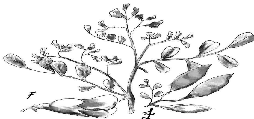
Figure 1. Dalbergia nigra (Vell.)AllemãoexBenth.- graphic representation of morphological characters

•Collaborate with local communities, NGOs, and government agencies to develop and implement conservation projects that are culturally appropriate and economically viable.