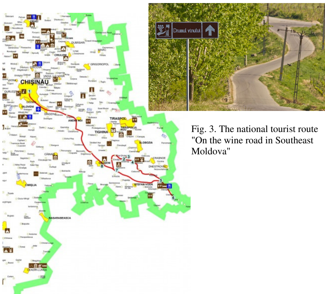
Fig. 3. The national tourist route "On the wine road in Southeast Moldova"