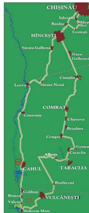
Fig. 1. The tourist trail to the best known wineries of southern of the Republic of Moldova.

Currently, this wine tourism itinerary has assessed primarily by completing considerably the visits to wineries, cellars and underground galleries to complement the collections of young wines, sparkling wines and cognacs from Chateau Vartely (Orhei), Fautor (Tigheci), Garling (Ungheni), Vinăria din Vale