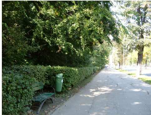
Fig. 4. Niche with a bank, on the Boulevard Pavel Kiseleff, in the year 2006

In fig. 4, It is to be noted that hedge hornbeam ( Carpinus betulus L) ., had some niches, in which they were located banks. The hornbeam can help to ensure the height required to that slots to provide isolation from the rest of the space.