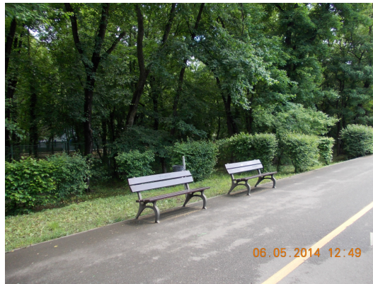
Fig. 6. Banks have been placed on the sidewalk outside former niches.

In addition, these banks can be seen along its entire length road, and casual "tired people", which slept on them, are exposed to sight and we don't think that their image makes a good impression for visitors - foreign and Romanian ones - in the buses which called "Bucharest City Tour".