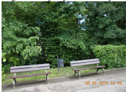
Fig. 5. Niches in which they were located banks can barely be identify

The hedge become an old one, that in many places can barely recognized its existence, and niches are gone in majority or can barely been identify (fig. 5).