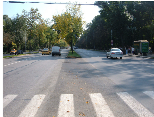
Fig. 3. Boulevard Pavel Kiseleff from "Piata preseii" up to the Arch of Triumph, has three lanes separated through spaces planted with a row of trees, (photo original)

From the Square of the Arch of Triumph, remain only four lanes, up from the Street Architect Ion Mincu. This portion has buildings surrounded by wide-open spaces, with rich vegetation- trees and bushes, which facilitates atmospheric currents. From the Street Architect Ion Mincu it links with Kiseleff Park, which it crosses up to the Museum of Geology – to Victoria Square. (Fig.2). Then, from Victoria Square up in the Romana Square, by the Avenue Lascar Catargiu, ensures good ventilation of the city, while maintaining a microclimate very comfortable and hygienic.