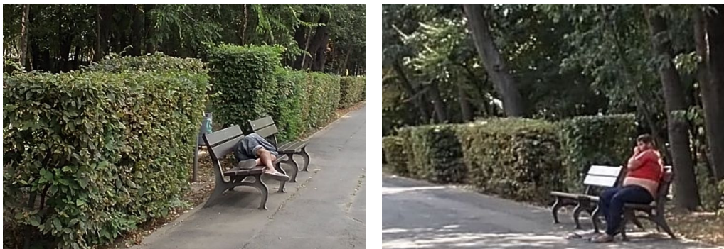
Fig. 7. Prospective „tired walkers” which sleep or are resting on the benches, are exposed to all vision along the road

In addition, these banks can be seen along its entire length road, and casual "tired walkers", which sleep on them, are exposed to sight and we don't think that their image makes a good impression for visitors - foreign and Romanian one - in the buses which are "Bucharest City Tour"