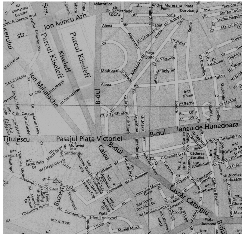
Fig. 2-B. Continuation of fig. 2-A, from Str. Ion Mincu Architect, by Kiseleff Park, up to Victoria Square and on Unirii Avenue Lascar until Romana Square.

From Piața Presei up to the Arch of Triumph, the Boulevard has three lanes - side two, each with three bands in only one direction, and, in the middle, with two lanes in each direction. These roadways are separated through spaces planted with a row of trees, (fig. 3), which determines, in addition to a safe fluency of vehicle traffic, also a very good air circulation. The road is lined by a strip with trees and shrubs, which separate it from the Sports Complex "Iolanda Balas-Söter" - on the right-hand side (seen in the Arch of Triumph direction) - and by the Village Museum of "Dimitrie Gusti" (on the left-hand side). These strips are delimited to pavements of a hedge hornbeam ( Carpinus betulus L.)