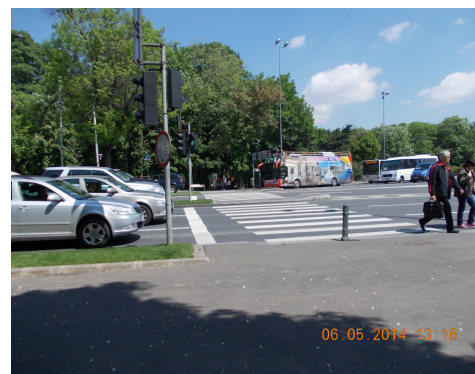
Fig. 1. Bus "Bucharest City Tour" included in the route and the Boulevard General Pavel Kiseleff

In the year 2011, the French journalist Audrey Favin (quoted by I. L. Popescu (2013) shows that, from an analysis of the company's market as the "Euromonitor", "Bucharest is the 55-th the most visited city in the world by foreign tourists, before some towns such as Milan, Venice, Florence (located on the sites 65.78 and 79) or Lisbon."